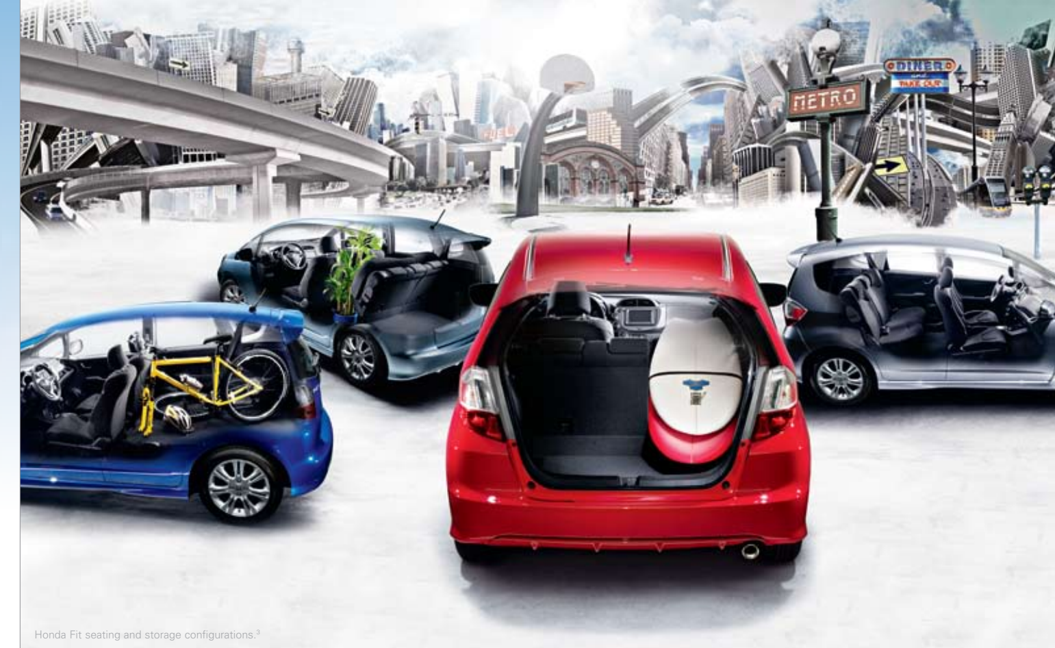
Honda Fit seating and storage configurations. 3

You've done your homework. Now let Honda Financial Services help you move forward with the Honda Graduate Program.