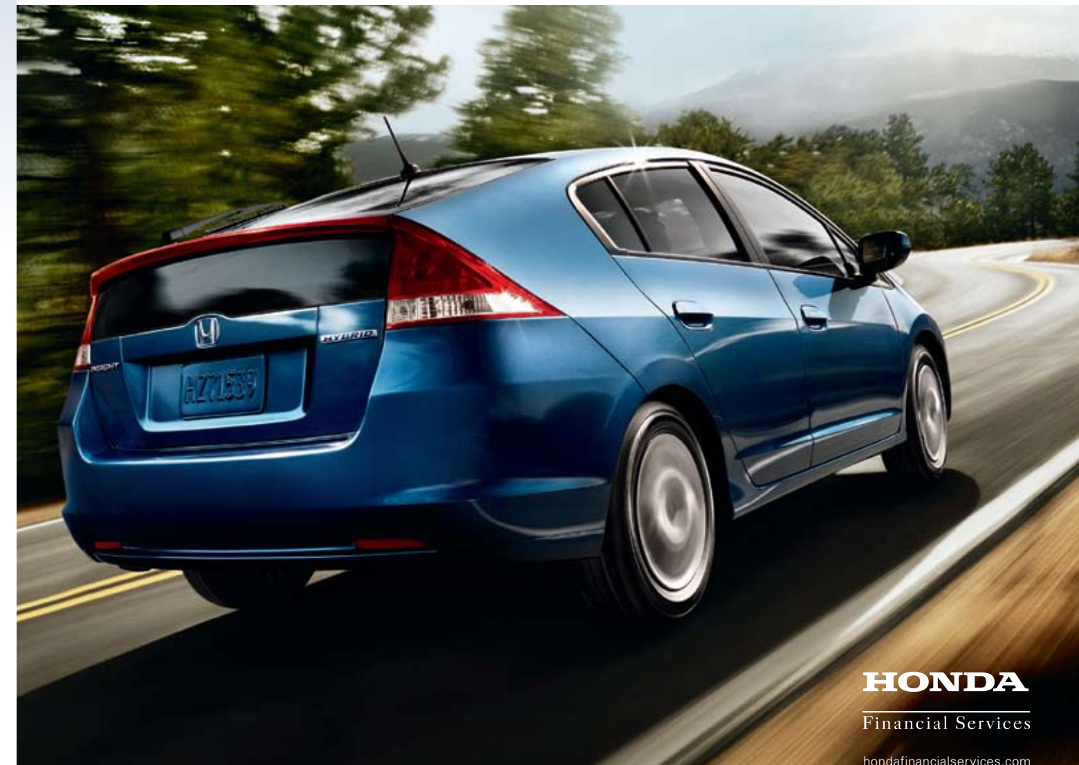
Insight LX shown in Atomic Blue Metallic.