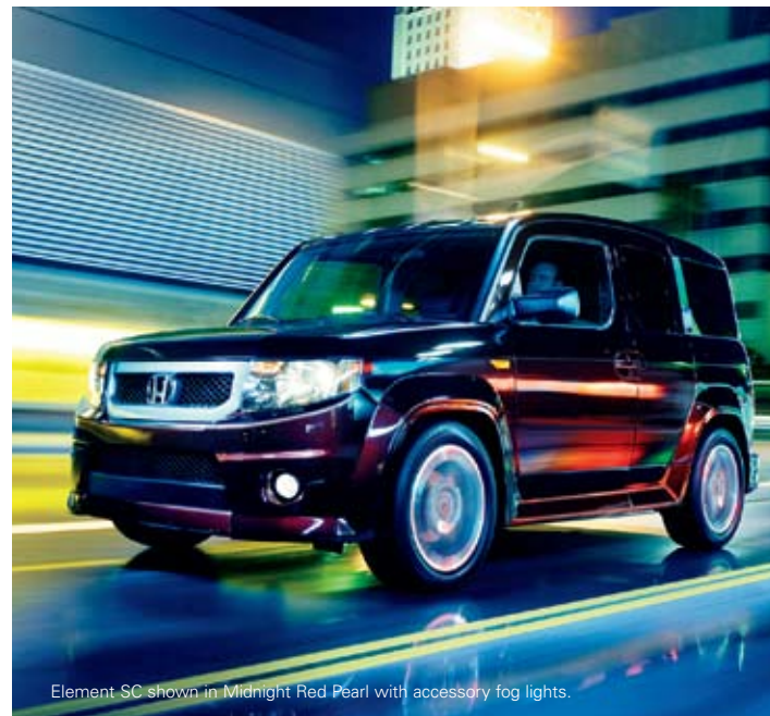
Element SC shown in Midnight Red Pearl with accessory fog lights.